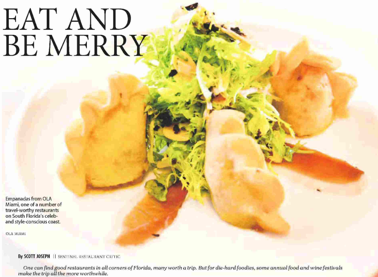
Empanadas from OLA Miami, one of a number of travel-worthy restaurants on South Florida's celeb- and style-conscious coast.